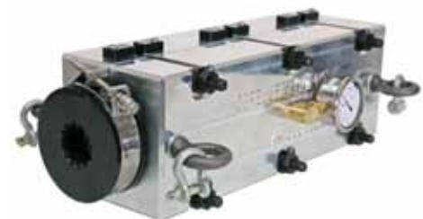
A1600 Grease Collar

All Corelube's lubrication systems come standard with a guide bushing and do not require the thrust block.