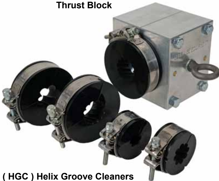
( HGC ) Helix Groove Cleaners