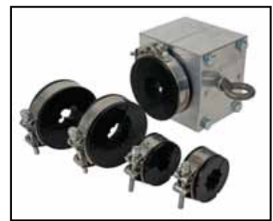
The Thrust Block option.

See our Thrust Block brochure for more information.