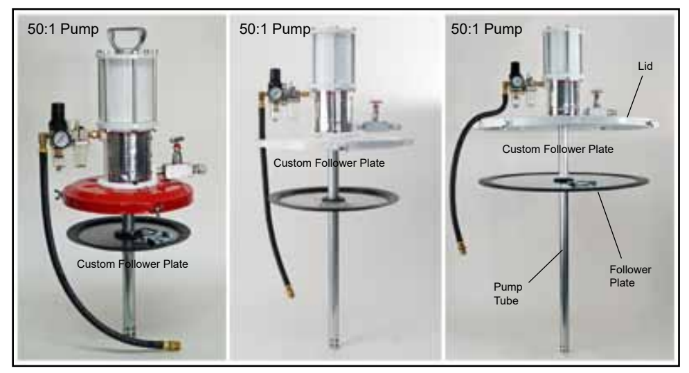
( LB3 ) Grease Pump Fits: 35 lb. Pail

The only difference between the grease pumps is the tube length, lid size & follower plate size for the 3 container sizes.