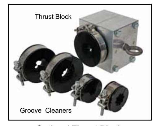
Optional Thrust Block