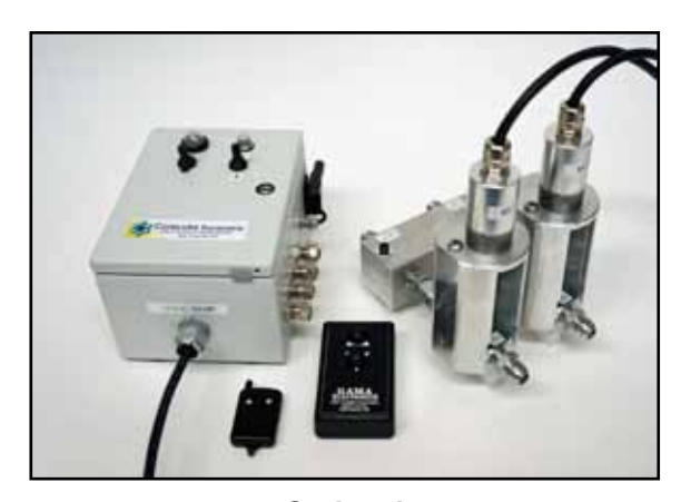
Optional Remote Control Flow Control Valve Units. Operate multiple pumps from a hand-held RF control.